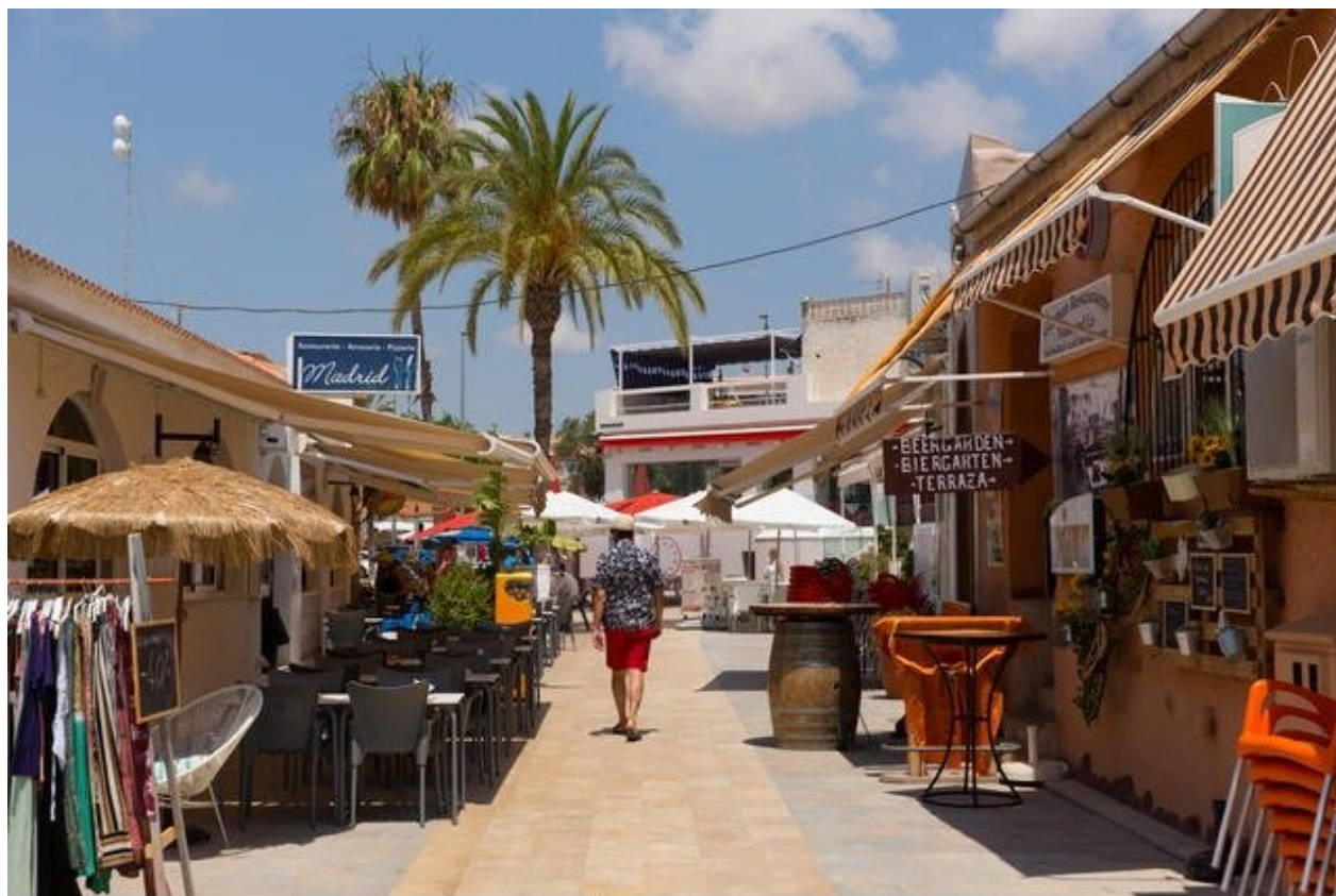
alamy - W3P0RK