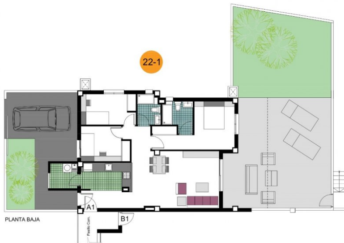
BLOQUE 1 VIVIENDA 22-1 PLANTA BAJA