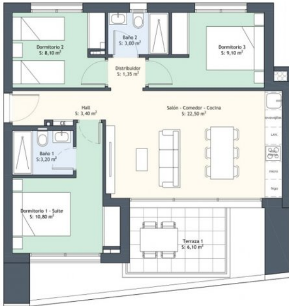
Planta Primera A B1 - 3 Dormitorios