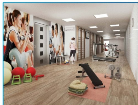
GIMNASIO / GYM