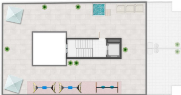
CUBIERTA / ROOFTOP