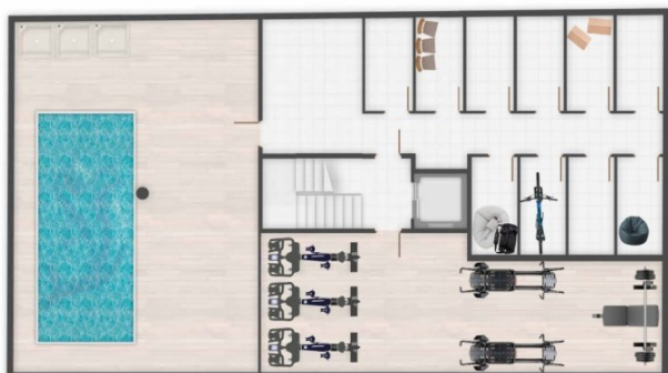
SÓTANO / BASEMENT