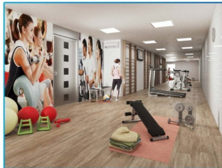
GIMNASIO / GYM