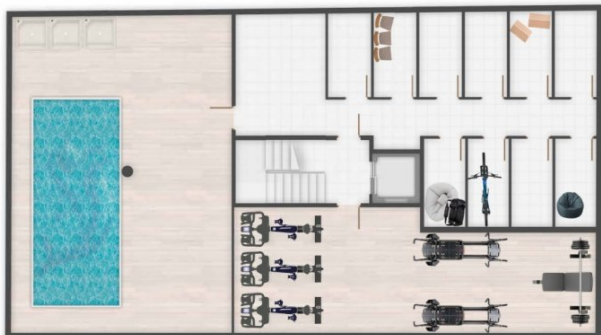
SÓTANO / BASEMENT