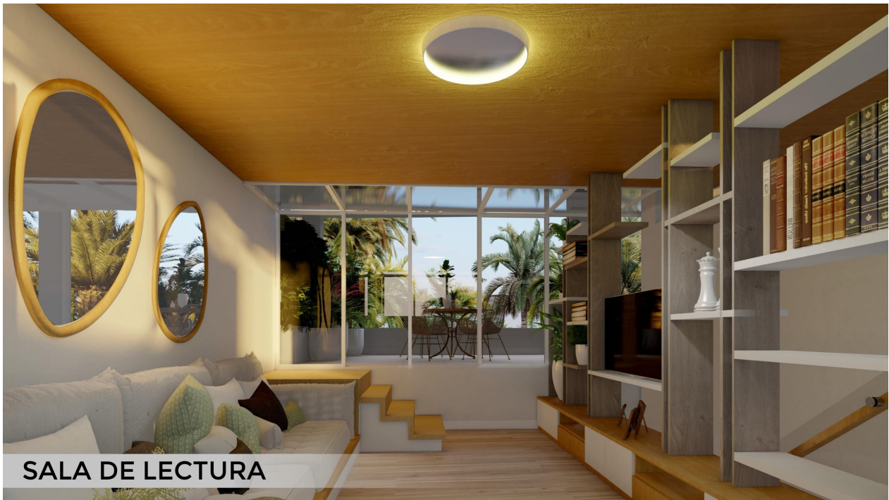
SALA DE LECTURA