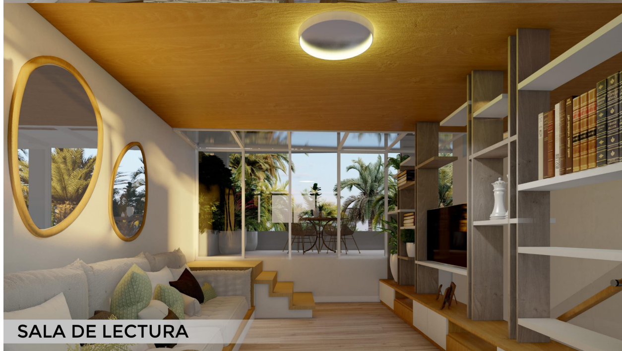
SALA DE LECTURA