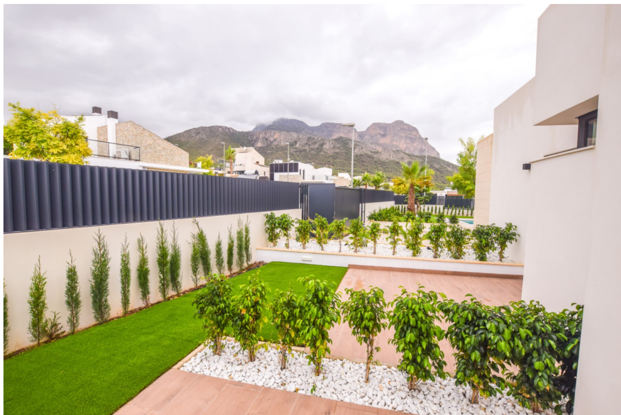
PARCELA 119. PLANTA BAJA CON PARCELA