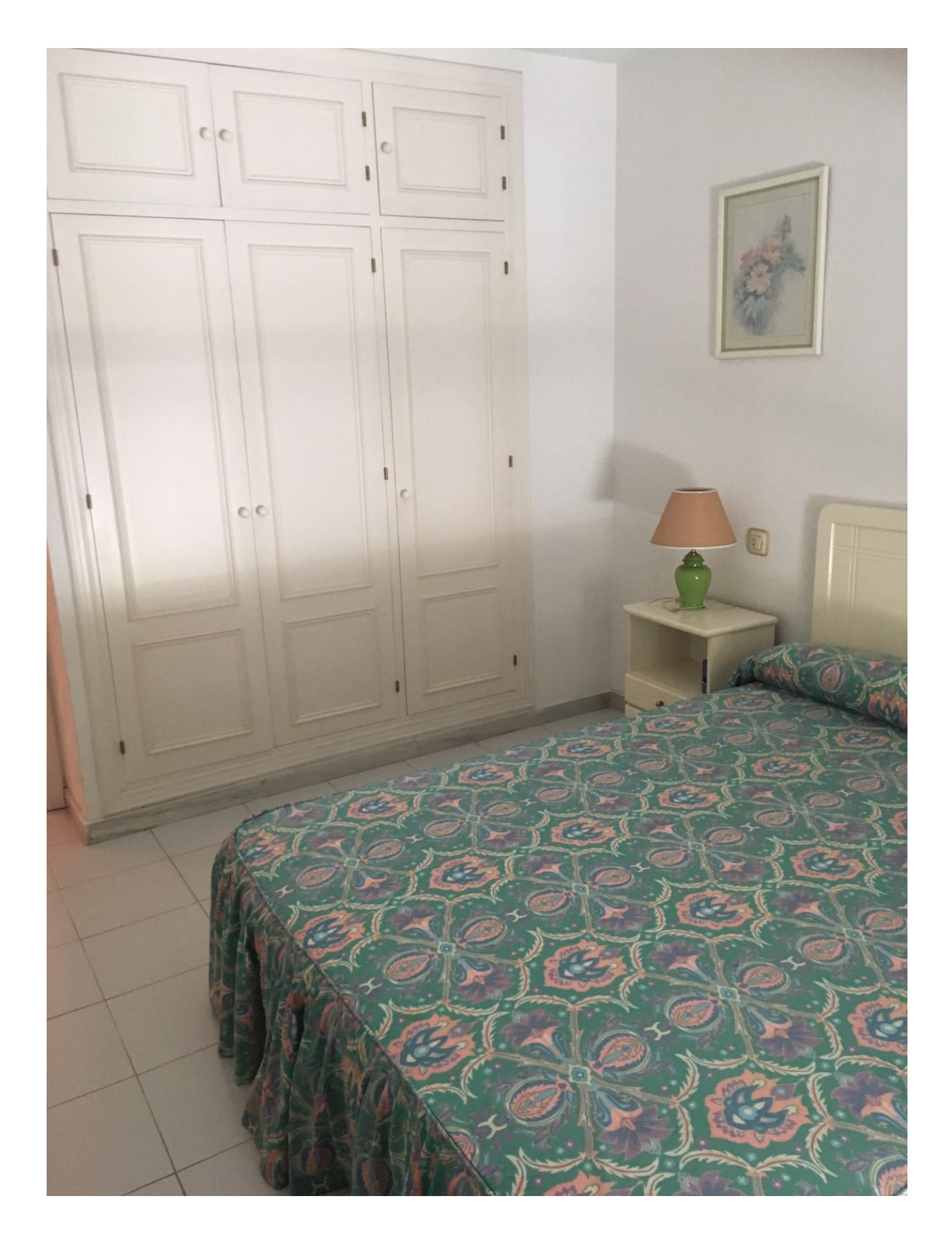
"Experience our experience - Because you deserve the best"