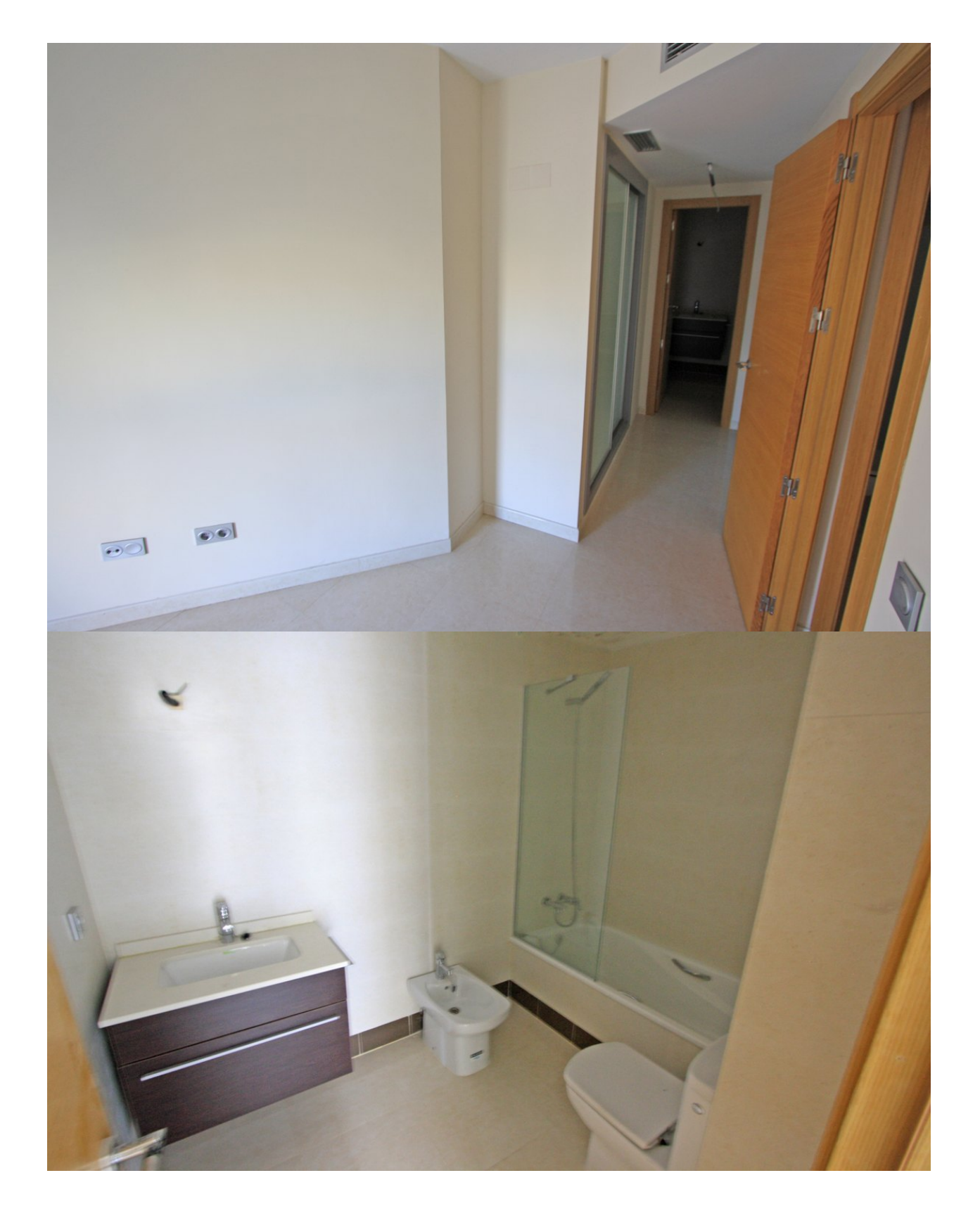
"Experience our experience - Because you deserve the best"